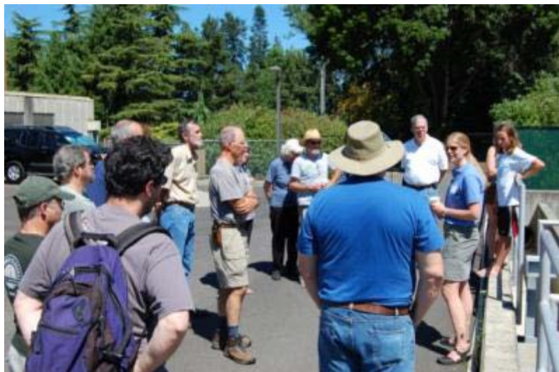
A water treatment plant open house held in August 2010 was well attended by neighbors.