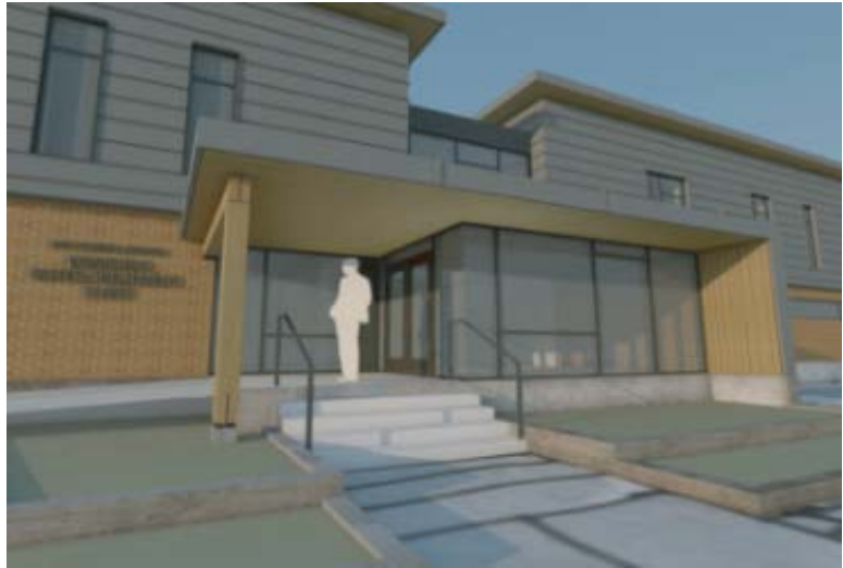
Residential scale and design features will make the treatment plant better fit the neighborhood setting.